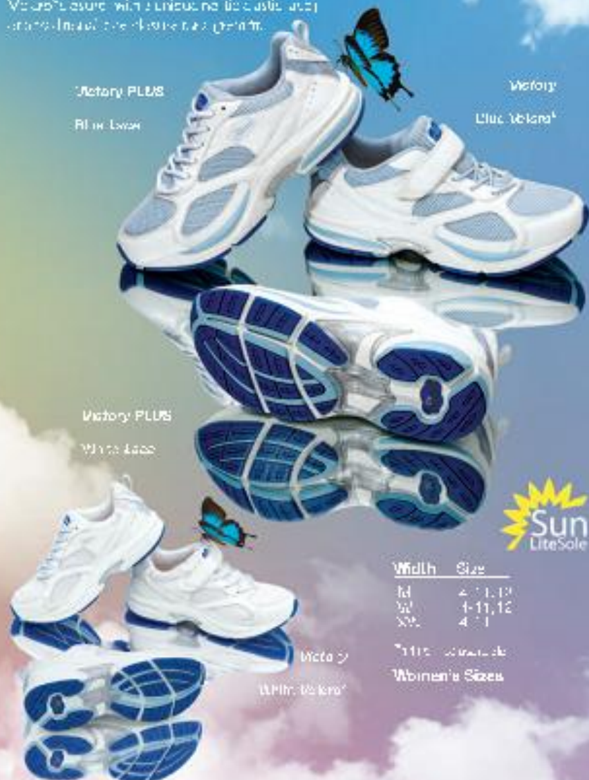
Victory PLUS White/Lace