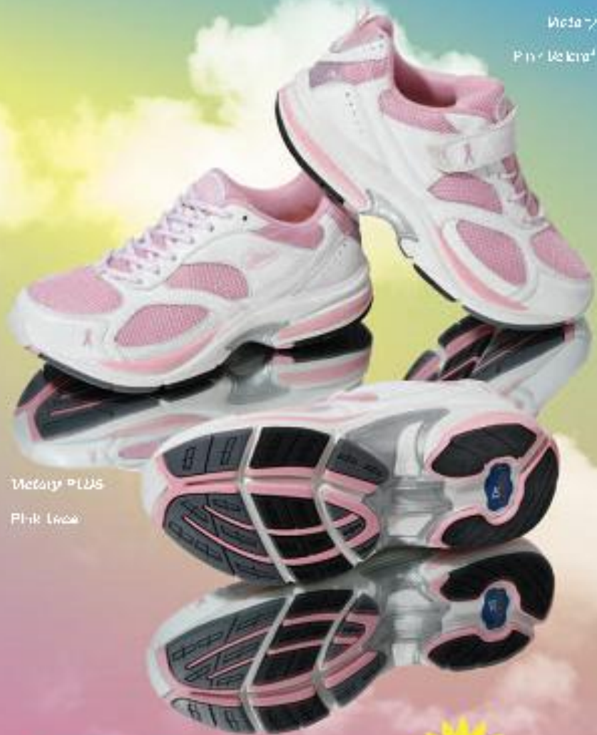
Victory PLUS Pink/Lace