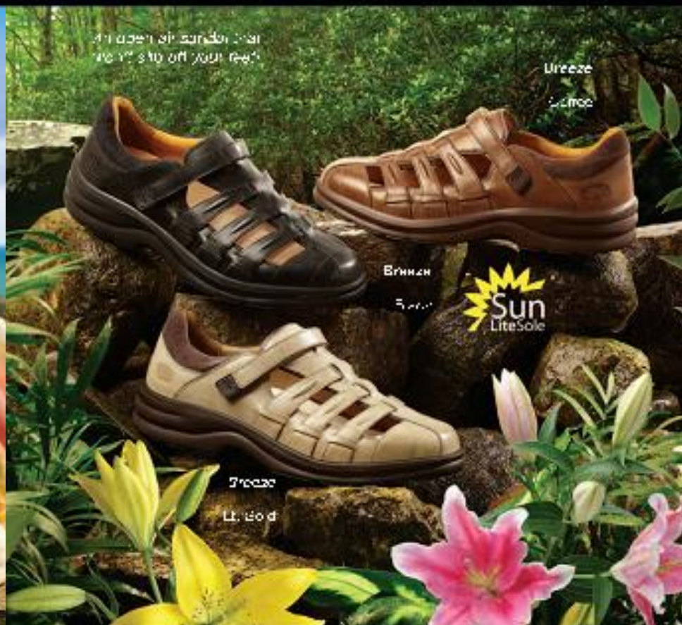
An open air sandal that lets your feet off your feet!