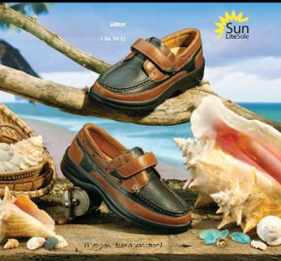
Wave L: 10-12

Lightweight open air shoe with extra cushioning and construction. The open design allows a cooling air flow to keep your feet comfortable. The shoe is built great for all indoor and outdoor activities.